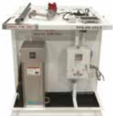
Portable Fuel Station solar setup for off grid use with bowser and electrical box

TRL's Fuel-Cell™ Portable Fuelling Stations are available in 3 sizes from 13,000 to 30,000 litres with the latest technology custom fuel systems. Designed to minimize your footprint and maximize storage capacity. Featuring a high level of integrated sophistication into their design and delivery including unmanned fuel stations with card access.