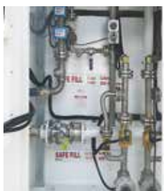
Bulk Storage quality fittings installed in pump bay