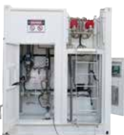
Bulk Storage Easy access to pump bay, man-way and dipping points

TRL Engineering's Fuel-Cell™ Bulk Storage solutions can be tailor-made to your requirements. Delivered in sizes from 11,000 to 110,000 litres they are ideal for small and large scale refuelling requirements. Fitted with the latest technology custom fuel systems and TRL's range of quality features standard.