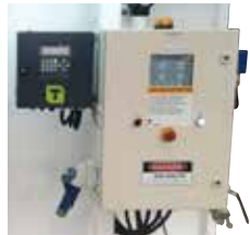
Portable Fuel Station fuel management system and electrical control box with emergency stop